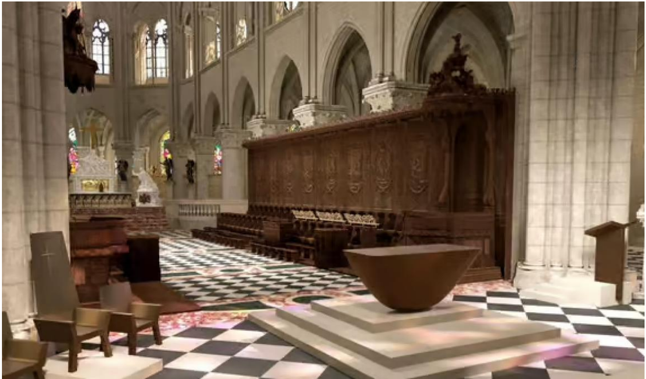
Mosaic pattern inside Notre Dame Cathedral built by the Knight Templars.

“La Papesse” is card number two of the tarot, a number symbolic of duality. Notice the Yin Yang symbol on the Priestess’s book representing the same dualistic principles of the mosaic pavement.