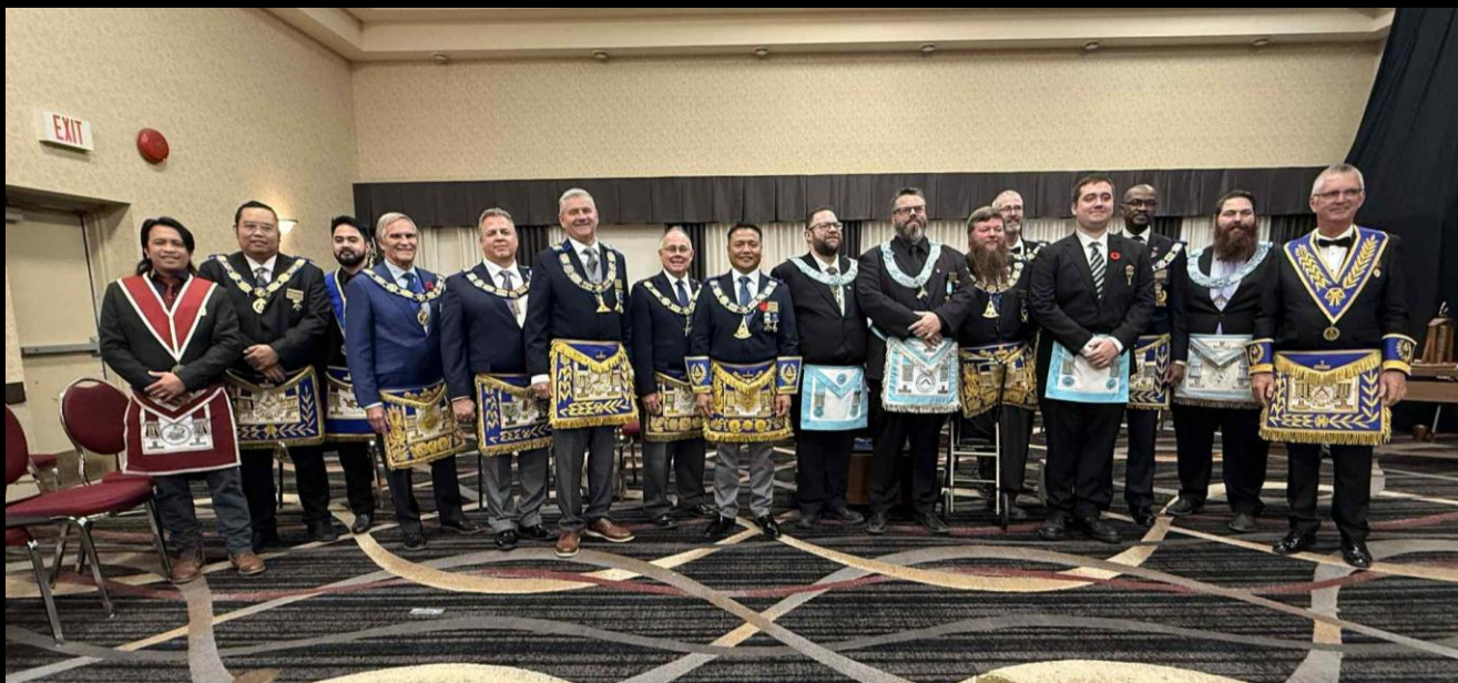
Hands Across the Border - Brandon, MB Nov 1, 2025