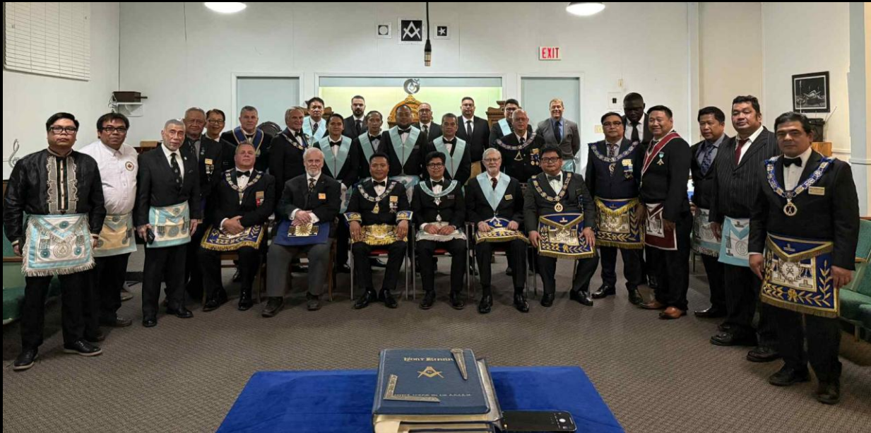
Sturgeon Creek Lodge #145 Official Visit Oct 6, 2025