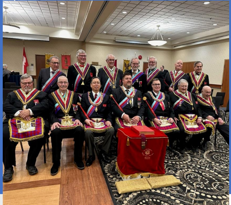
Grand Convocation Grand Chapter of Royal Arch Masons of Manitoba April 26-27, 2024, Victoria Inn Hotel