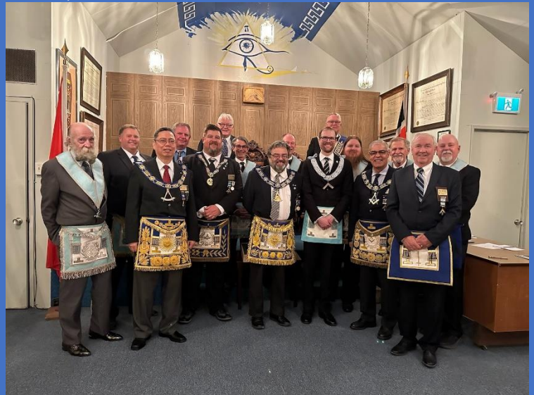
In-person meeting of Castle Island Virtual Lodge No. 190 At the Sturgeon Creek Masonic Hall June 6, 2024