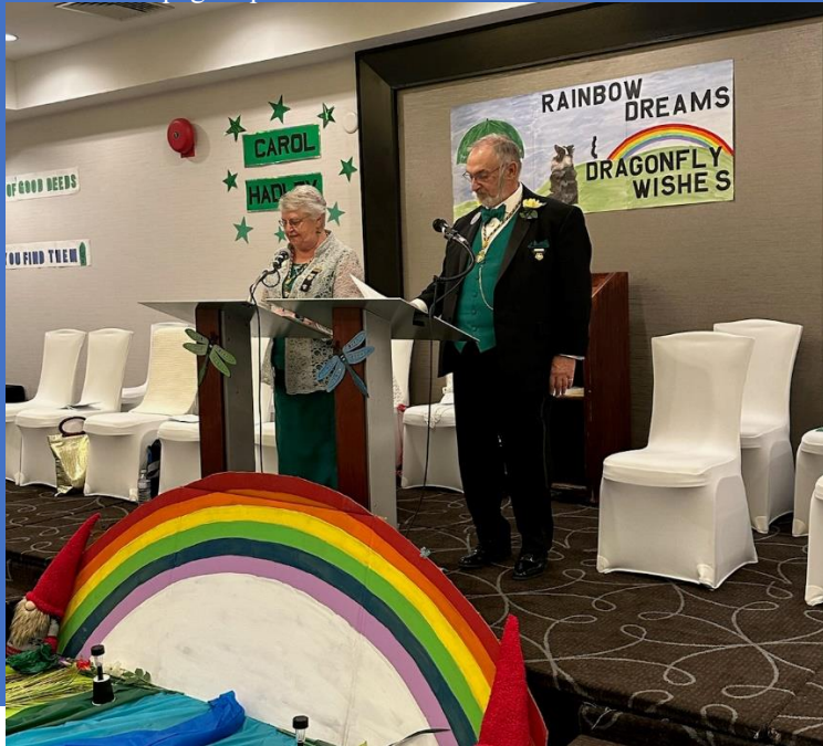
Grand Session of Grand Chapter Order of the Eastern Star, May 26 to 29, 2024 Hilton Winnipeg Airport Suites